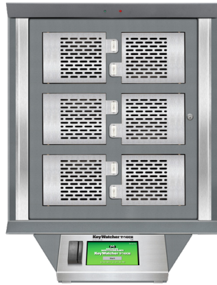
Single Locker Module