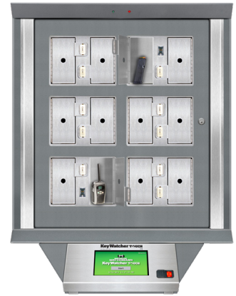
Dual Locker Modules